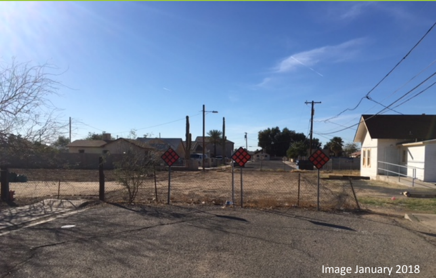
Image January 2018