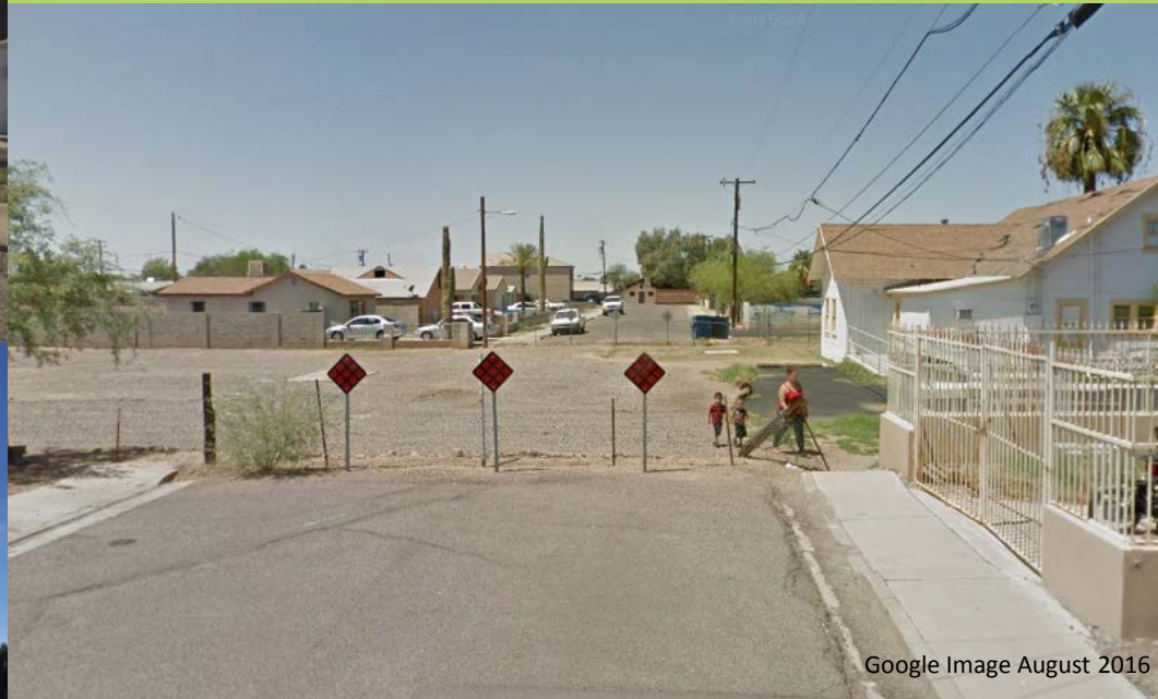
Google Image August 2016