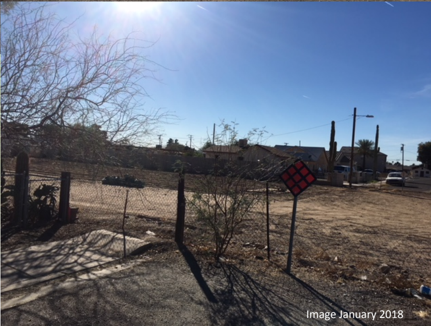
Image January 2018