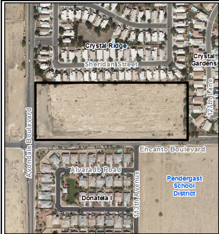
Aerial Photograph San Villagio MID